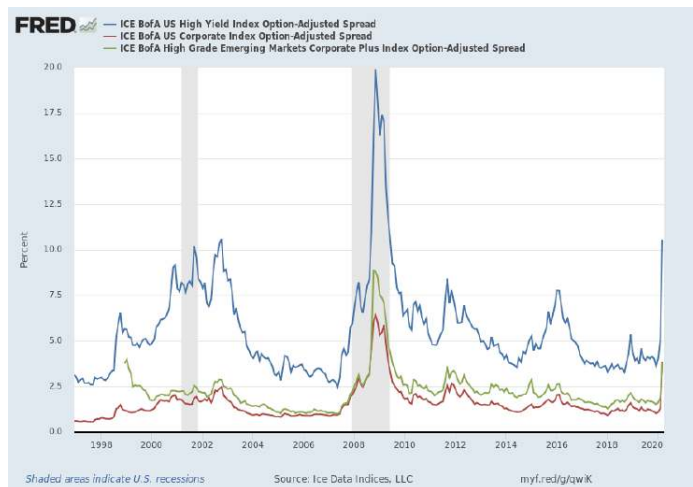
FIGURE 1: FIXED INCOME YIELD SPREADS